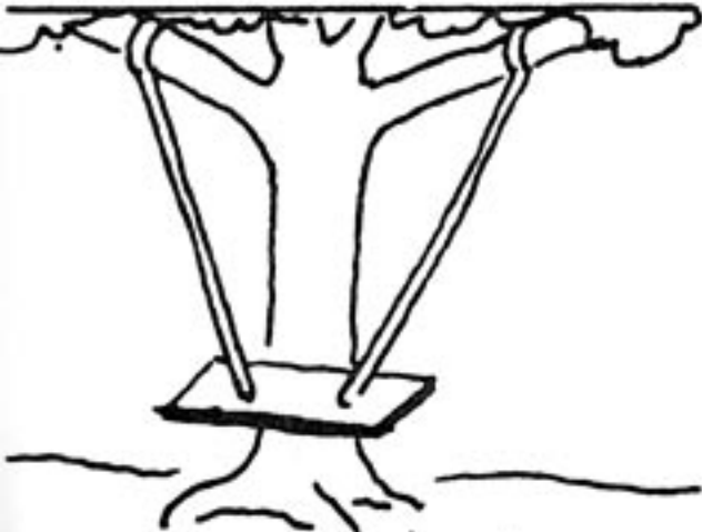
WHAT THE ENGINEERS SUGGESTED.