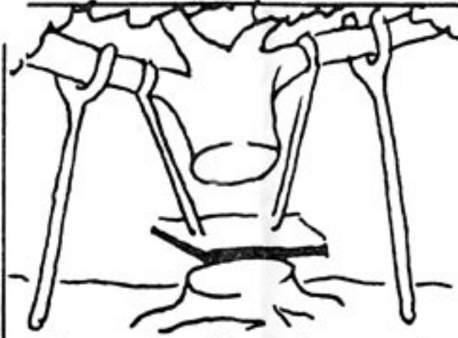
HOW THE DIRECTOR USED IT.