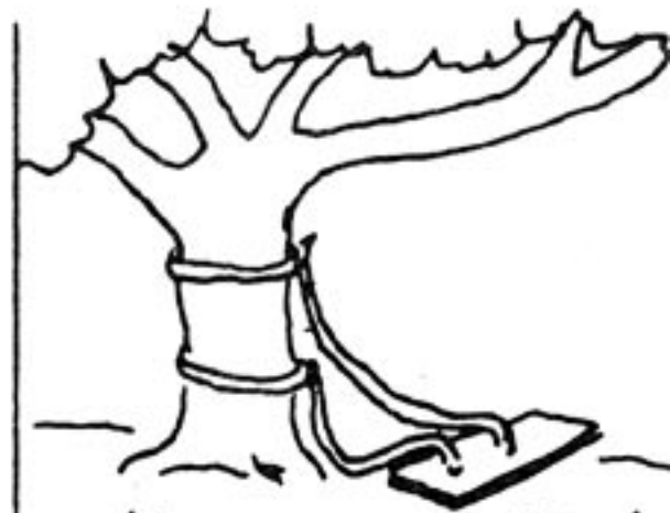
HOW THE CREW SET IT UP.