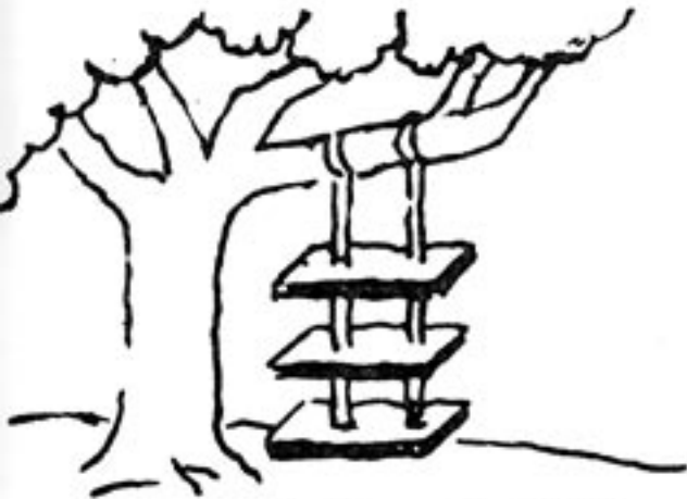
HOW THE WRITER WROTE IT.